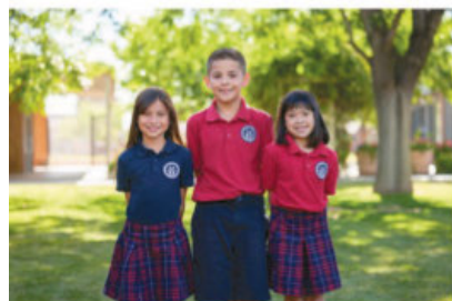
Our Lady of Mt. Carmel Catholic School

The Falcon Family Fund's mission is to provide financial support where assistance is necessary for members of the Our Lady of Mount Carmel Catholic School community who experience financial need.